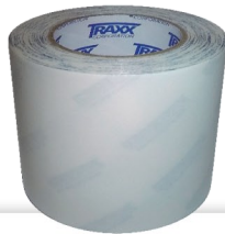
4 Inch Double-Sided Tape Part TSU-40200-DST4