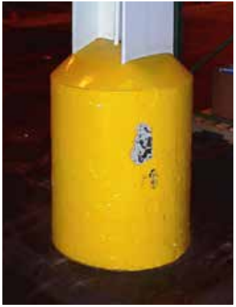
Damaged unprotected column