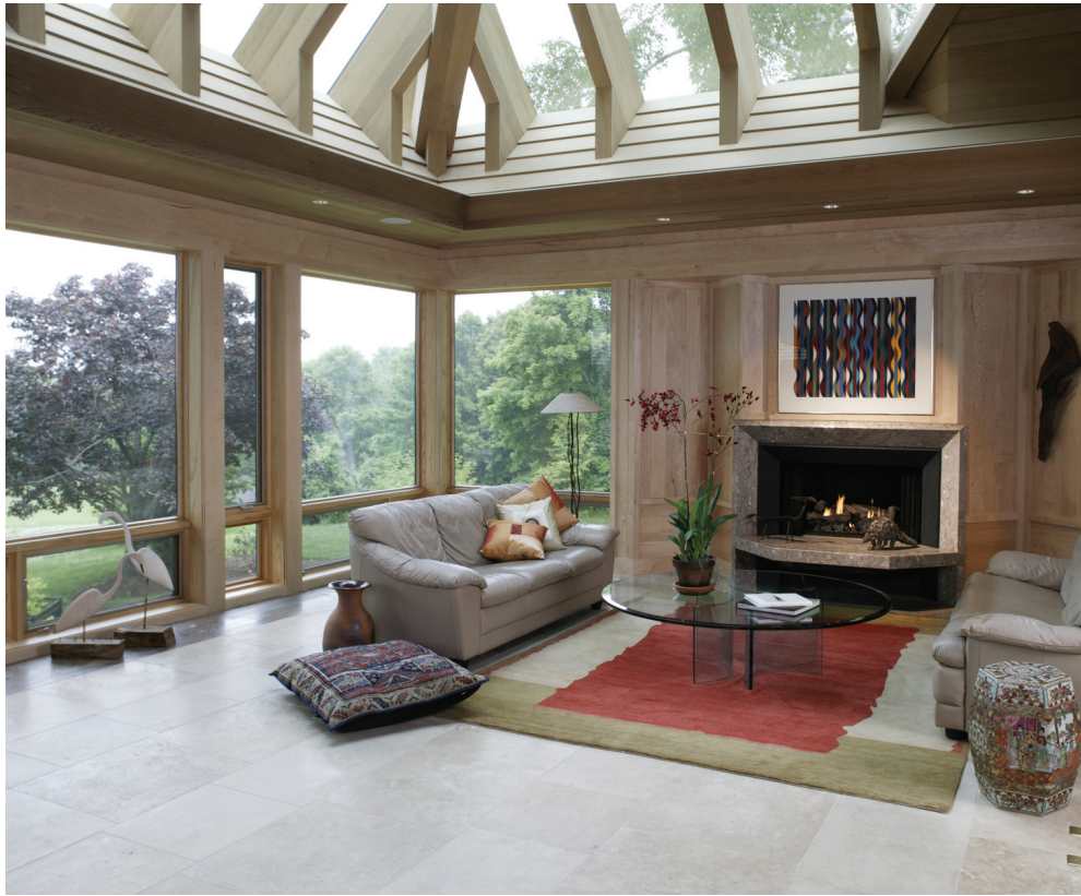
Private Residence, Woodbridge, CT