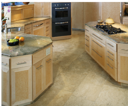
Private Residence, Woodbridge, CT