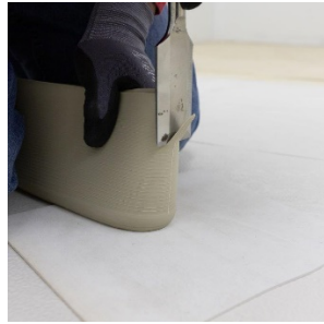
b. Make one continuous cut with a sharp 1 1/2" wood chisel