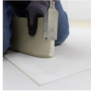
c. Shave both sides, starting half-way down and avoid cutting into the original center cut