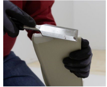
d. Fold Tightly - groove out remaining upper portion. Nip top (see completed corner below)