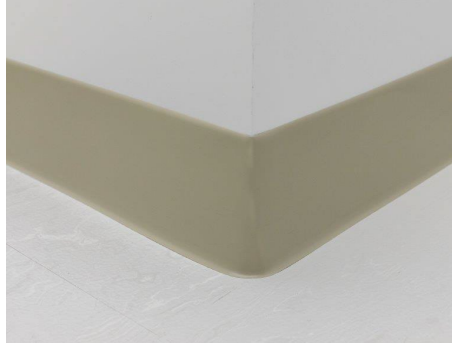
f. Finished Corner