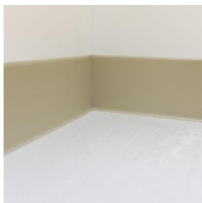
e. Finished Corner