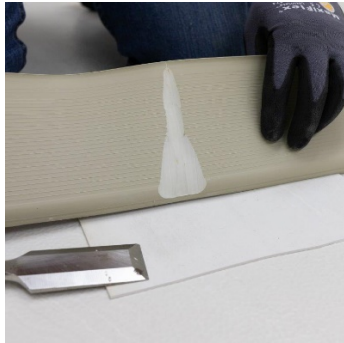
e. Finished cut