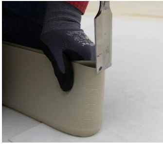
a. Fold base in half