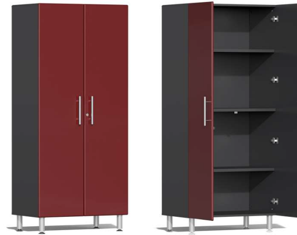
Ruby Red Metallic and Peppercorn Grey

Modular 2-Door Tall Cabinet incorporates custom shop style and contemporary features to meet the most discerning project demands.