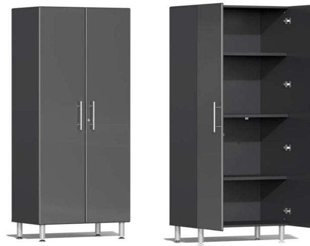
Graphite Grey Metallic and Peppercorn Grey

Modular 2-Door Tall Cabinet incorporates custom shop style and contemporary features to meet the most discerning project demands.