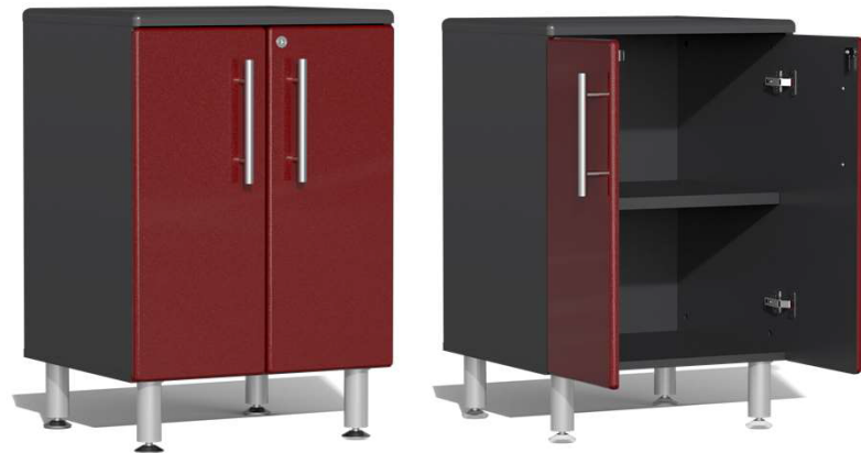
Ruby Red Metallic and Peppercorn Grey

Modular 2-Door Base Cabinet incorporates custom shop style and contemporary features to meet the most discerning project demands.