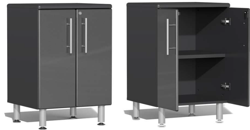
Graphite Grey Metallic and Peppercorn Grey

Modular 2-Door Base Cabinet incorporates custom shop style and contemporary features to meet the most discerning project demands.