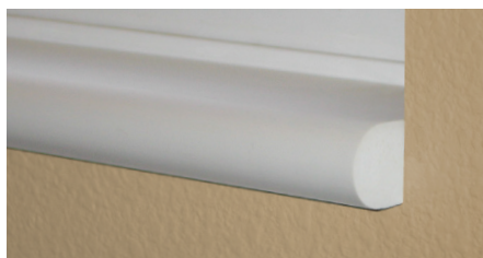
KSC Standard Sills are available in two attractive profiles: Classic and Streamline