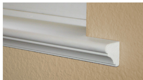
Sills can be installed with flush ends or with extended ends.