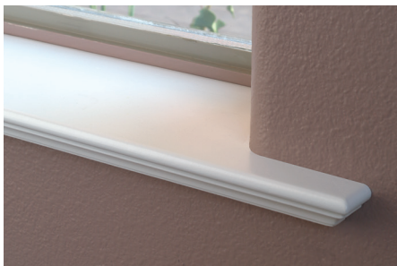
Finished on both ends - not butt cut

KSC Premium Window Sills are available in sizes to fit the standard window openings. Each sill is completely fabricated with a striking profiler on not only the front but both ends - unlike sills that are butt cut