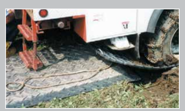
Driver called for help. AlturnaMATS® were brought to the scene and tied to the chains. By putting the vehicle in reverse, the MATS were drawn under the wheels. A second MAT was placed behind the wheels enabling the vehicle to back out easily.