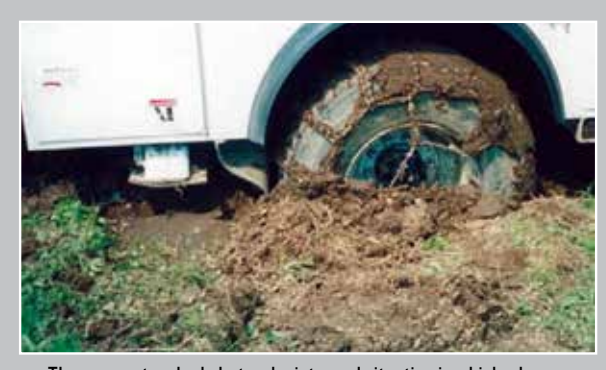
These un-retouched photos depict a real situation in which a heavy vehicle with chains got stuck in a deep mud hole.